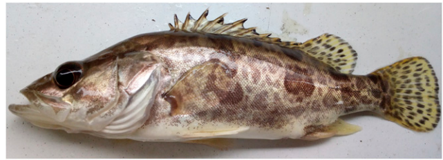
Figure 1 The big-eye mandarin fish ( Siniperca knerii ) collected from Yangzhong, Jiangsu Province of China.

The assembled genome of S. knerii was searched for repetitive sequence using RepeatModeler v1.0.8 (Arian and Robert 2008) with default parameters. The database of repeat sequences constructed using RepeatModeler contains all repeated sequences, and may also contain protein-coding sequences, so the repeat sequences were compared to the perciform genes using blast. The repetitive sequences having hits to protein-coding sequences were excluded from the repeat sequence database for further analyses (File S2). Finally, the genome was subjected to repeated sequence screening using RepeatMasker v4.0.7 (RepeatMasker, RRID: SCR_012954) according to the constructed repetitive sequence database (Arian and Robert 2013–2015). The Maker v2.31.10 (MAKER, RRID: SCR_005309) pipeline was used for gene prediction (Carson and Mark 2011). Models used for gene prediction include